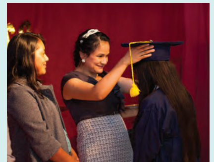
Ericka placing cap on a graduating student

Bonus! If you’re one of the first 40 people to support a class at $50/month, an additional $250 will be donated towards health benefits for our teachers, thanks to a generous donor.